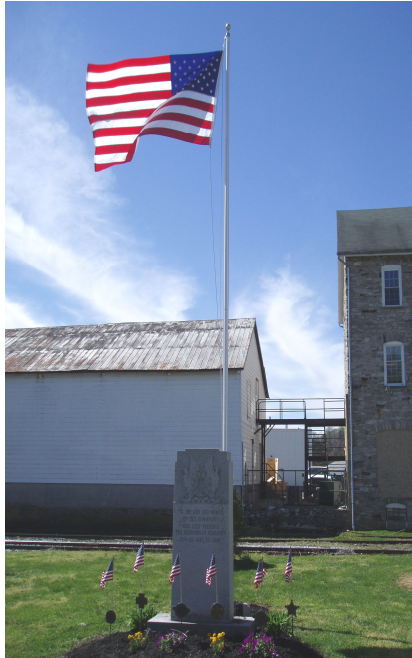
NEW FLAG POLE

If you want to receive the quarterly newsletter, please notify the Borough Office to be put on the mailing list. This is a special mailing of the newsletter.